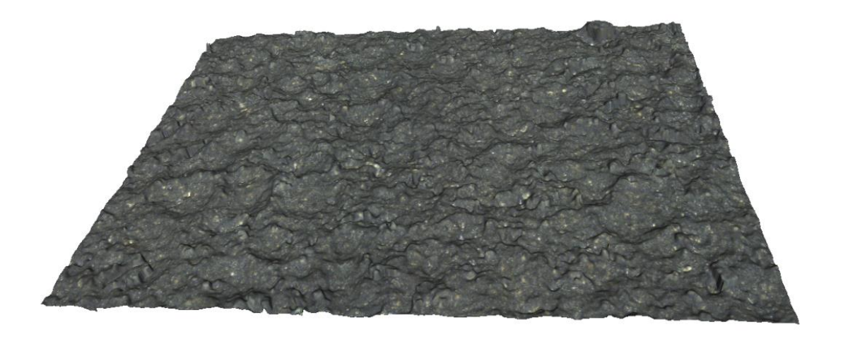
Figure 2: 3D measurement, from the InfiniteFocus of the hot plate surface in true color. The hot plates warm up the cover film before sealing it onto the base foil. Alicona enables Uhlmann to determine the surface finish parameters (Sa, Sz) and material parameters (Sk, Spk).

This provides a sound statement about the functional behaviour of the surface after evaluating the material ratio parameters."