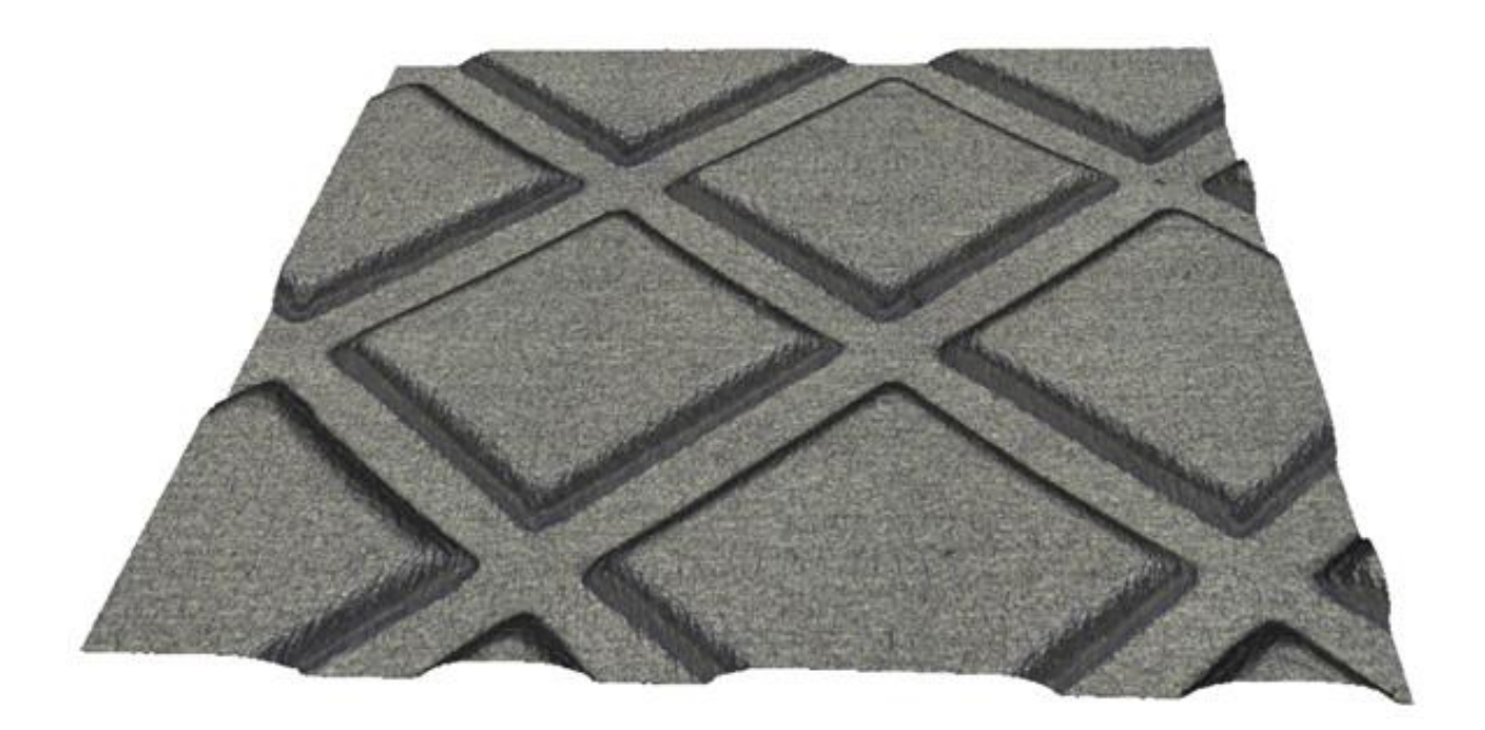
Figure 3; 3D measurement of a blister sealing area in true color

After sealing the carrier foil and cover film, it is possible to emboss specific safety features (e.g. batch number) permanently on the blister reel. The serial numbers are punched in using die stamps. Uhlmann use InfiniteFocus to ensure the correct letter height of the die stamp, measure the surface roughness and perform a visual inspection.